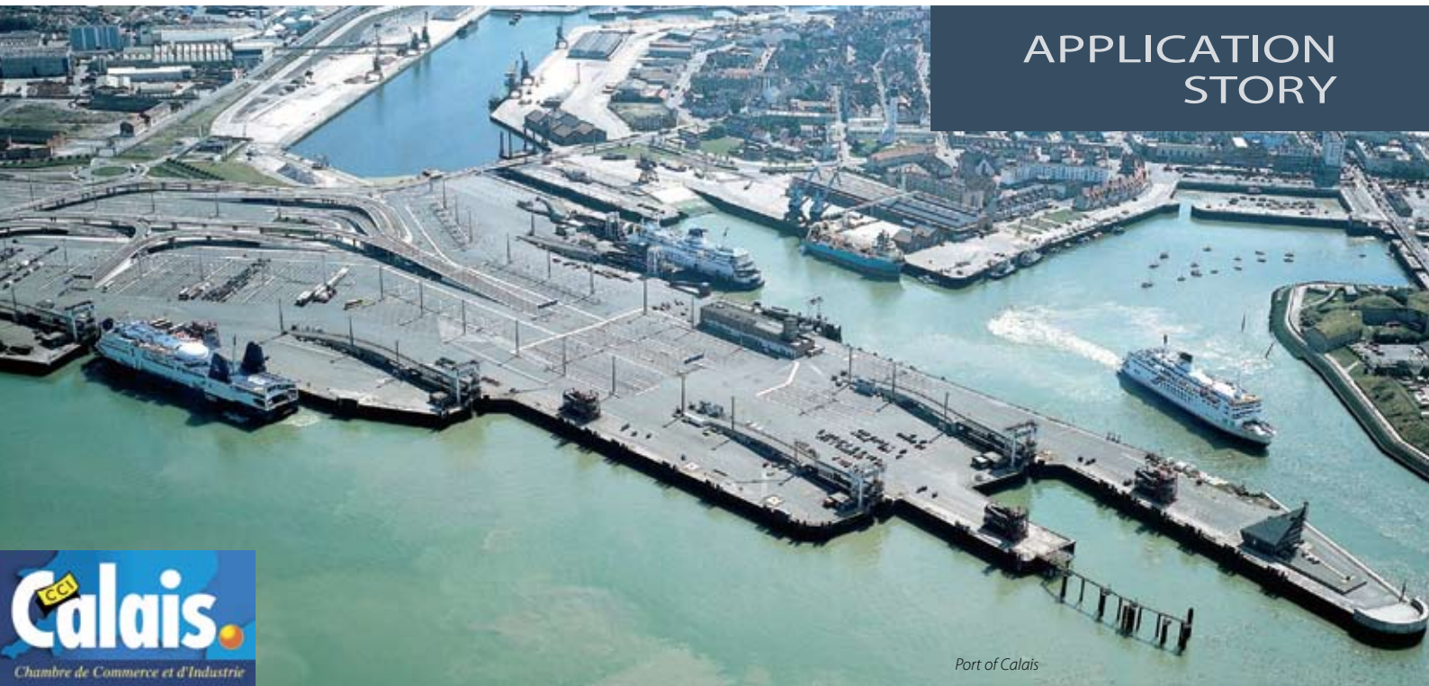
Port of Calais