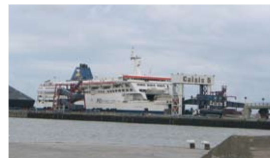
Port of Calais