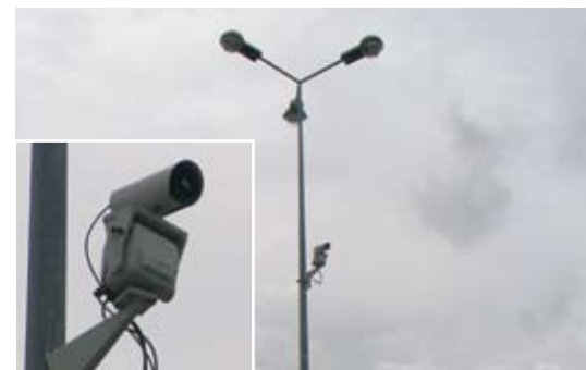
One of the FLIR Systems SR-50 cameras in the Port of Calais.

"Today we are very happy with our thermal imaging cameras. Since the Calais Chamber of Commerce and Industry has serious expansions plans for the near future, we will have to evaluate in a later stage if and where we need to install more thermal imaging cameras.", concludes Mr. Couret.