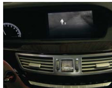
The thermal images generated by the PathFindIR can be displayed on any multi-function LCD display that accepts composite video. In this case on an LCD integrated in the Mercedes dashboard.