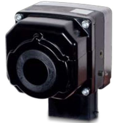
FLIR Systems PathFindIR can be easily integrated in all types of cars, busses and trucks.

"The feedback we are getting from the users of the PathFindIR is very positive. They tell us that the display on which the thermal image is projected quickly becomes a natural checkpoint for the driver just like side-view or rear-view mirrors. It helps them tremendously when driving at night but also in rain, fog and other harsh weather conditions."