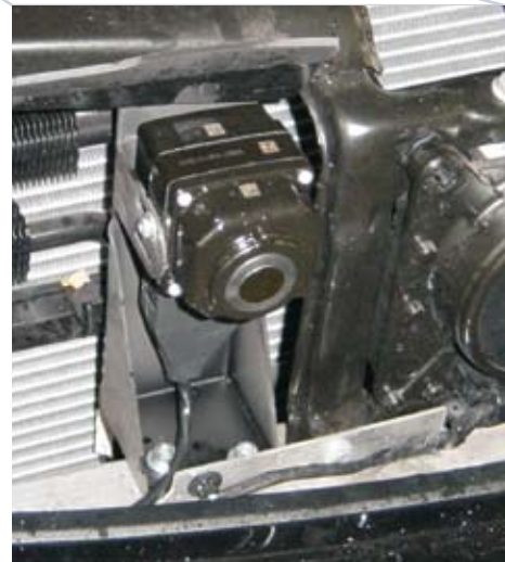
The FLIR Systems PathFindIR installed behind the vehicle grid of an armored Mercedes.

Finally, for international organizations on diplomatic missions; humanitarian aid organizations; NGOs; and Foreign Office / Ministry of Defence (MoD)