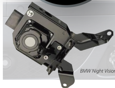
BMW Night Vision module